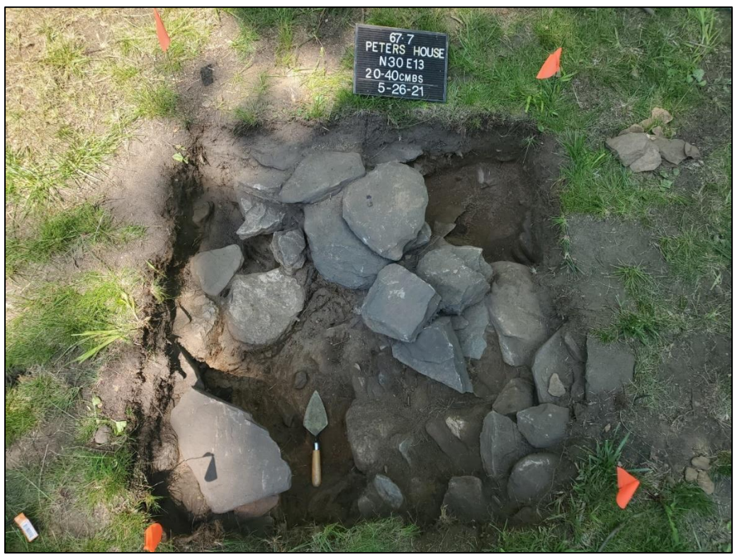
Figure 4: Shallowly buried wall footing in N30 E13.