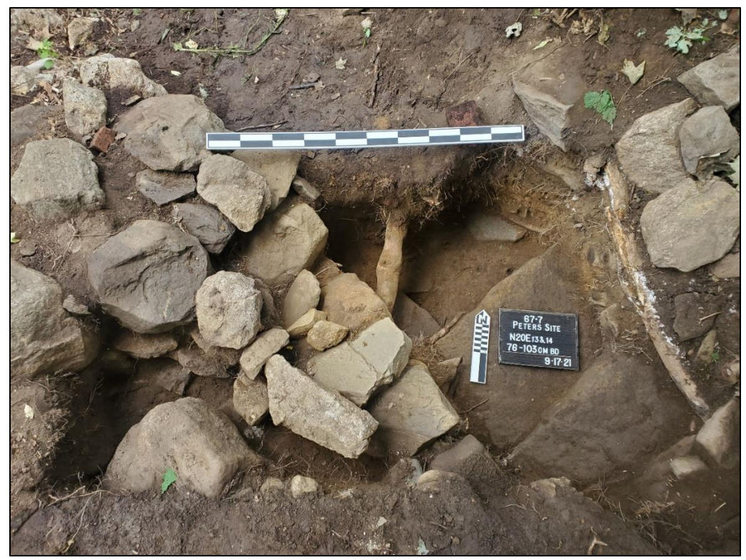
Figure 3: Buried stone steps leading down into the cellar on the south side of the foundation.