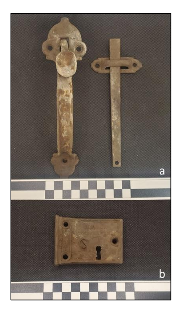
Figure 6: Selection of door hardware recovered at the Peters House Site: a) Norfolk style thumb latch and bar latch; b) mortise lock with wood screw in place, "M.W. & CO New Haven."