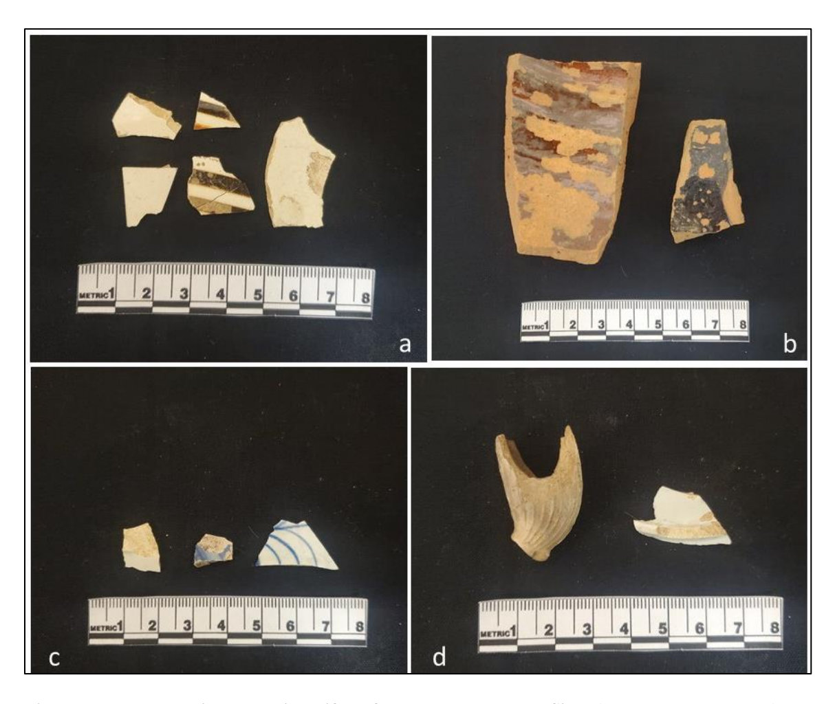
Figure 5: Representative domestic artifacts from the Peters House Site: a) creamware sherds, b) red earthenware bowl sherds, c) pearlware sherds, d) molded kaolin tobacco pipe bowl and pearlware sherd with footring.

Finally, a chert Atlantic projectile point (Late Archaic; 4,100-3,600 BP) was recovered from N20 E14, near the cellar stairs. The point was likely integrated into archaeological deposits when the cellar and stairway were originally excavated. At this point it is not known if the point is an isolated find, or if the Peters House was located on an earlier Native American site. The presence of the project point reflects the long history of Indigenous peoples in the Hebron area.